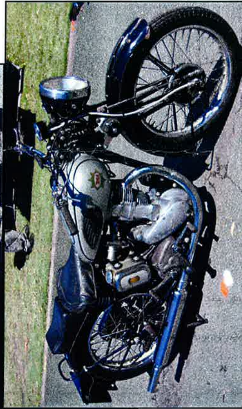
Keith Wendell's 1938 Gold Star reckoned to be the first one

What a treat for BSA nutters. Two of the first Gold Stars built to-