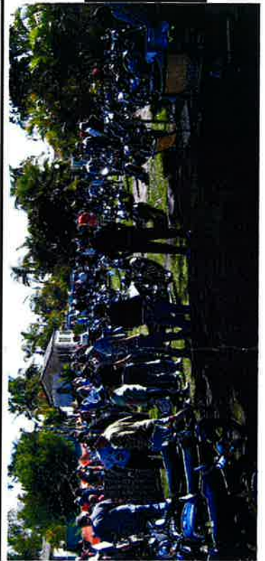
Show and Shine on Saturday afternoon