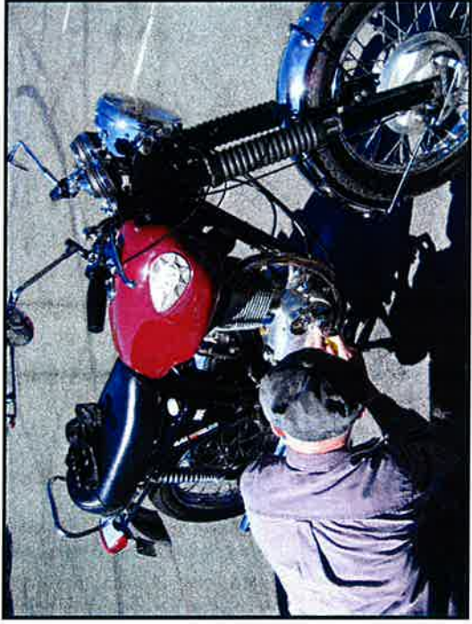
Timing the beast on the Sunday run. Try doing that on yer modern Kawahonsuzyama